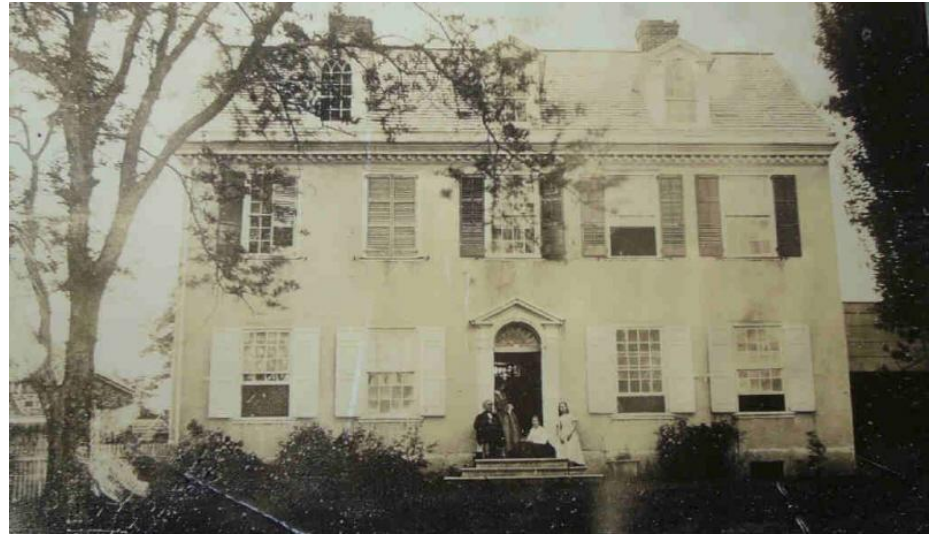
(Photo of the Historic Selma Mansion in the 1800's provided by The Norristown Preservation Society.)